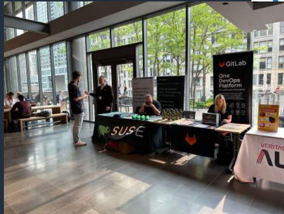
5' tables in the 2023 Chicago event

Dedicated tables in sponsor expo for Gold